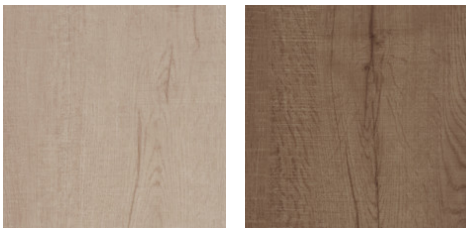
Balance 77755 LRV 30.7 V2 - Slight Variation Golden 77756 LRV 15.2 V3 - Moderate Variation

Shade and texture variation is inherent in all resilient products and can vary significantly from piece to piece. Samples should be used to assess color.